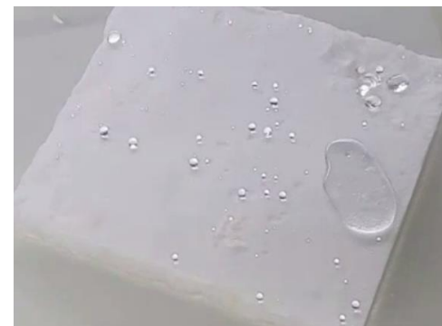
Super Hydrophobic, IRogel Board

Landfill disposable, shot-free, with no respirable fiber content