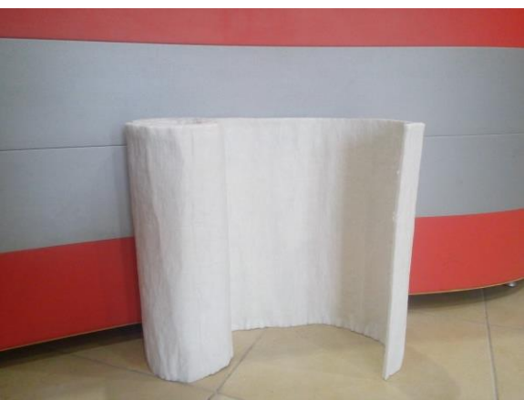
5 - 12 mm flexible blanket

IRogel® is an opacified aerogel blanket for effective blocking of the radiation component of heat transfer. It delivers excellent thermal insulation up to 1200°F (650°C) for applications including aerospace, transportation, industrial equipment, power generation, nuclear power plants, high-temperature thermal and fire protection.