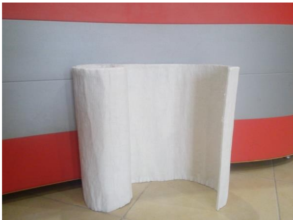
5 mm flexible blanket

IRogel® is an opacified aerogel blanket for effective blocking of the radiation component of heat transfer. It delivers excellent thermal insulation up to 1200°F (650°C) for applications including aerospace, transportation, industrial equipment, power generation, high-temperature thermal and fire protection.